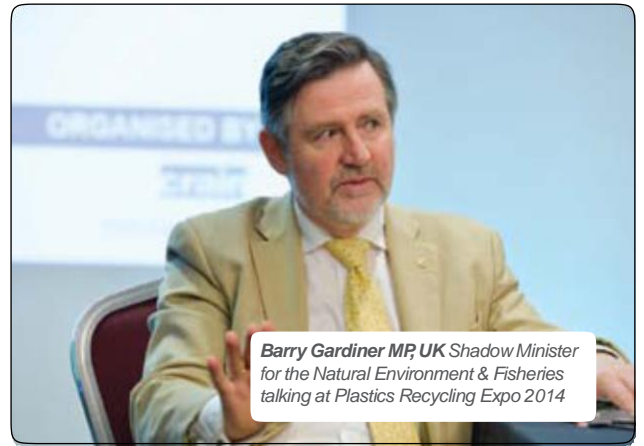
Barry Gardiner MP, UK Shadow Minister for the Natural Environment & Fisheries talking at Plastics Recycling Expo 2014

“To achieve the new recycling targets we must increase the plastics recycling capacity in the EU. The Plastics Recycling Show is a fantastic opportunity to demonstrate your knowledge and expertise in collection, sorting, grinding, washing, drying and extrusion to investors, waste management companies, brand owners, converters, entrepreneurs and recyclers. EU and national policy makers and many other stakeholders will also visit this unique trade show in the heart of Europe in order to better understand how plastics will contribute to the circular economy. If you believe in plastics recycling come and join us!”